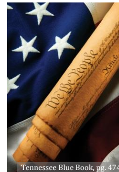
Tennessee Blue Book, pg. 474

For additional lesson plans, click here .